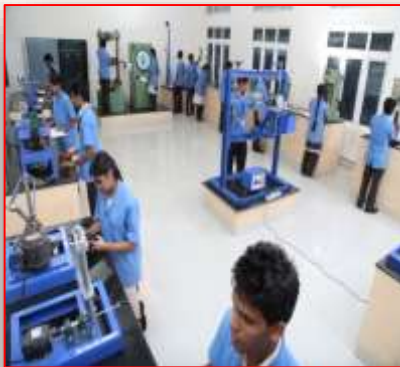
STRENGTH OF MATERIAL LABORATORY