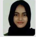
FASNA P V (BPS) Manjushree Technopack Limited Bangalore 560100,