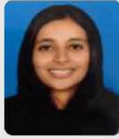
MEZYUNA (PS) Manjushree Technopack Ltd. Bangalore 560100