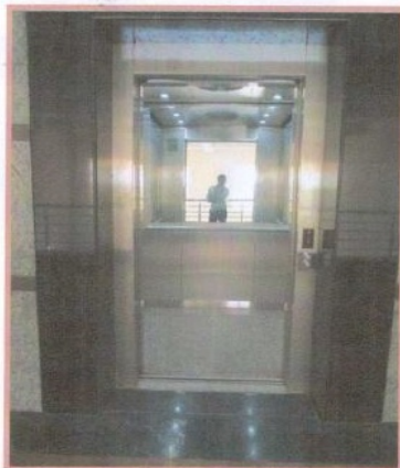
C ) BARRIER FREE BUILT ENVIRONMENT AND TOILETS CREATED FOR PHYCICALLY CHALLENGED WORKING LIFTS FOR G+2