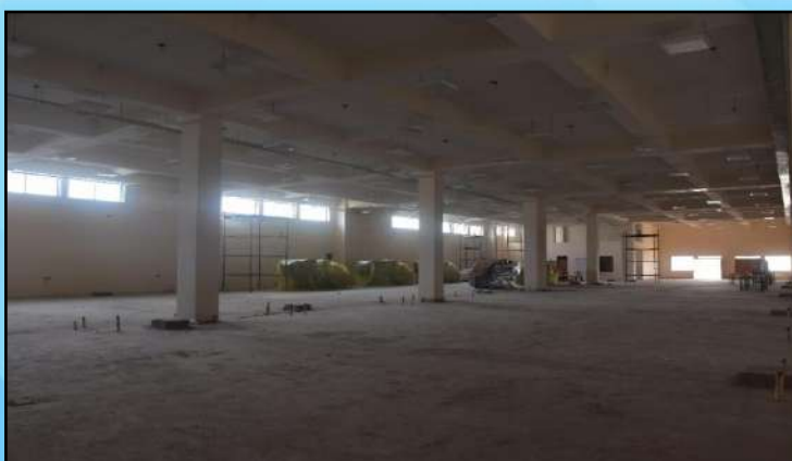
Workshop building at Korba centre