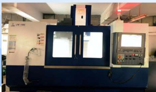
LAKSHMI MACHINE WORK (LMW/JV-100) CNC Vertical Milling Centre