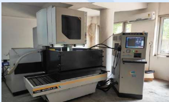
Electronica Hitech / Tool Master 6S