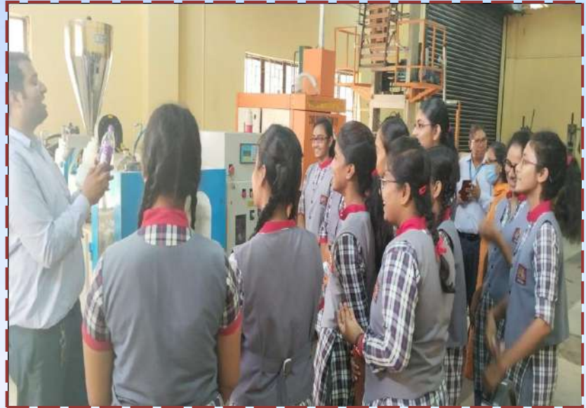
Awareness Programme for Kendriya Vidyalaya, IOCL, Haldia Students at Haldia centre under the Standard Club Activity of BIS Kolkata on 11 th July, 2022.