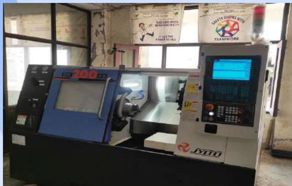
Jyoti Dx-200 4a CNC Lathe Machine