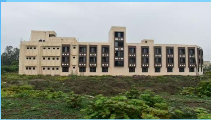
Boys hostel at Raipur centre