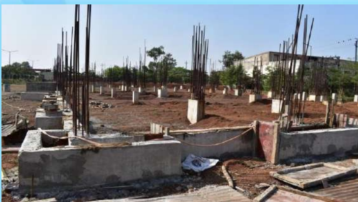
Academic block at Raipur centre