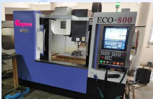
Macpower / Eco -800 CNC Vertical Milling Centre