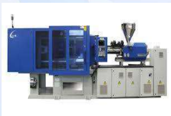
Automatic Microprocessor Controlled IMM 200T (for PVC material)

Procurement of New Machines for PVC Moulding – Bhubaneswar – CSTS