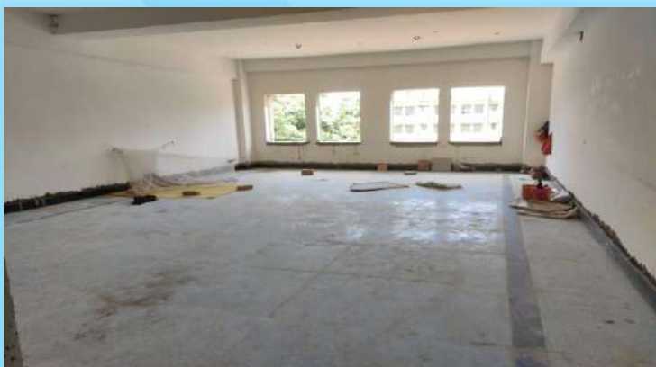
Class room at Ranchi centre