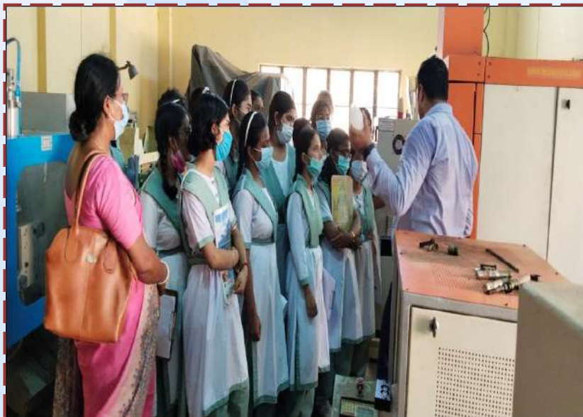
Awareness Programme for Rajkumari Santanamoyee Girls High School, Tamluk Students at Haldia centre under the Standard Club Activity of BIS Kolkata on 12 th July, 2022.