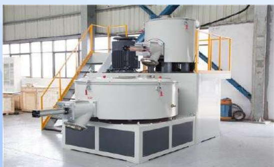
PVC Compounding Mixture