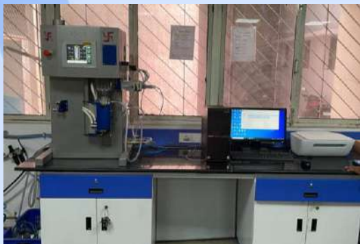
Microcompounder (MC15HT) and Cast Film Line instrument

Civil Infrastructure are expanded based on the need at CIPET centres. Technical Infrastructure are enhanced to meet the latest technology in the domain.