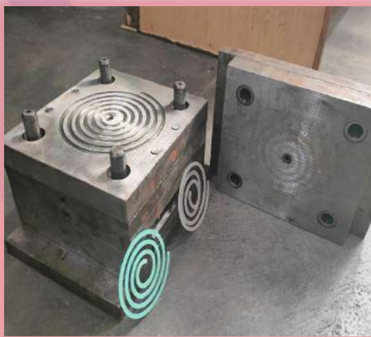
Two plate single impression Injection mould

An exclusive injection mould has been developed in Tool Room at Baddi Centre to demonstrate the students practically on study of Melt Flow Index Rate (MFR) of different plastics materials in Injection Mould. This will help to set the processing parameters in Injection Moulding process.